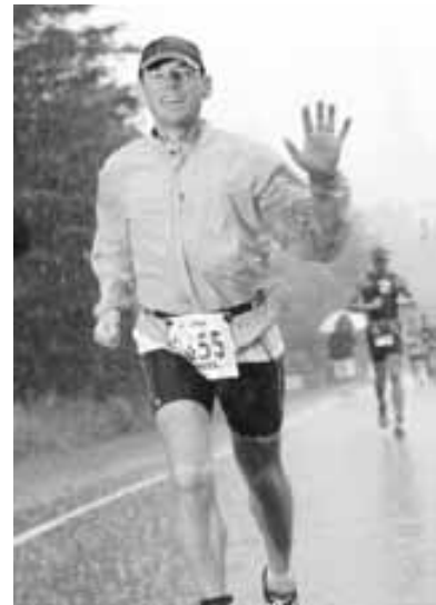
The Iron Friar

2010 Campaign closes July 31, 2010. Your gift could help shorten waiting lists, open new shelter beds, and serve more meals for those in need around us. Please help maximize the impact of your gift to Sharelife this year. For more information visit: www.sharelife.org . Please give generously. You can work WONDERS!